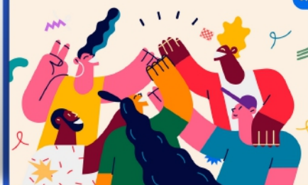
Illustration by Pushkar Das XB