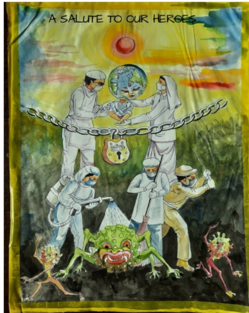
Illustration by Biraj Ghoshal XC

France was the epicentre of Spanish flu. It first originated in a hospital, overcrowded camp which was an ideal site for spreading respiratory virus. The hospital treated 100,000 patients of chemical attacks.