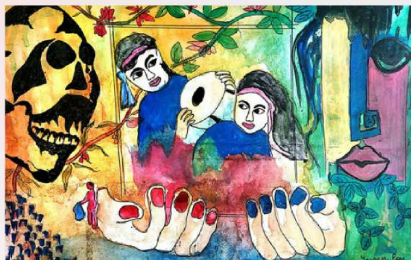
Yaman Roy X C