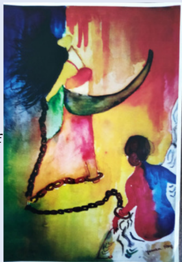
Yaman Roy XC